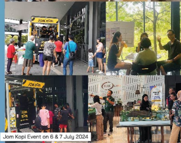
Jom Kopi Event on 6 & 7 July 2024