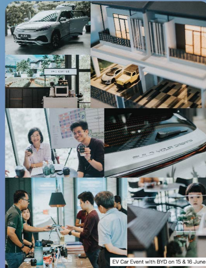
EV Car Event with BYD on 15 & 16 June 2024

Various weekend activities were organized to foster better ties and interaction within the community. From capturing family memories at the Parent's Day Portrait event to exploring cutting-edge electric vehicles at the BYD showcase, and savoring coffee and conversation during the Jom Kopi event, it was a time of joy and togetherness. A big thank you to everyone who participated and made these moments special.