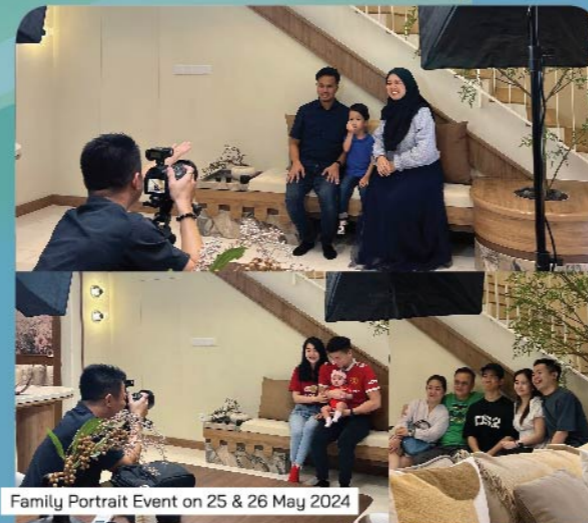
Family Portrait Event on 25 & 26 May 2024

Refiller Mobile provides refillable, affordable, and eco-friendly products, including cleaning agents, personal care items, snacks, and pet treats. These products are safe for both people and the planet, helping to reduce plastic waste. Join us in our journey towards zero waste.