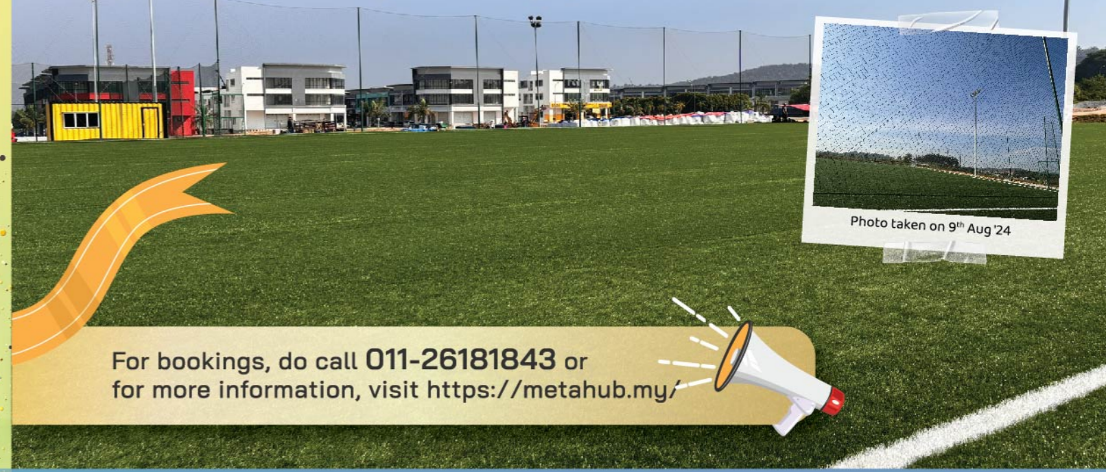
Photo taken on 9 th Aug '24

Exciting news for football enthusiasts! The BSC football fields have been officially opened for bookings on 15 August. This provides the community with a great opportunity to organise friendly matches or league games on dedicated pitches.