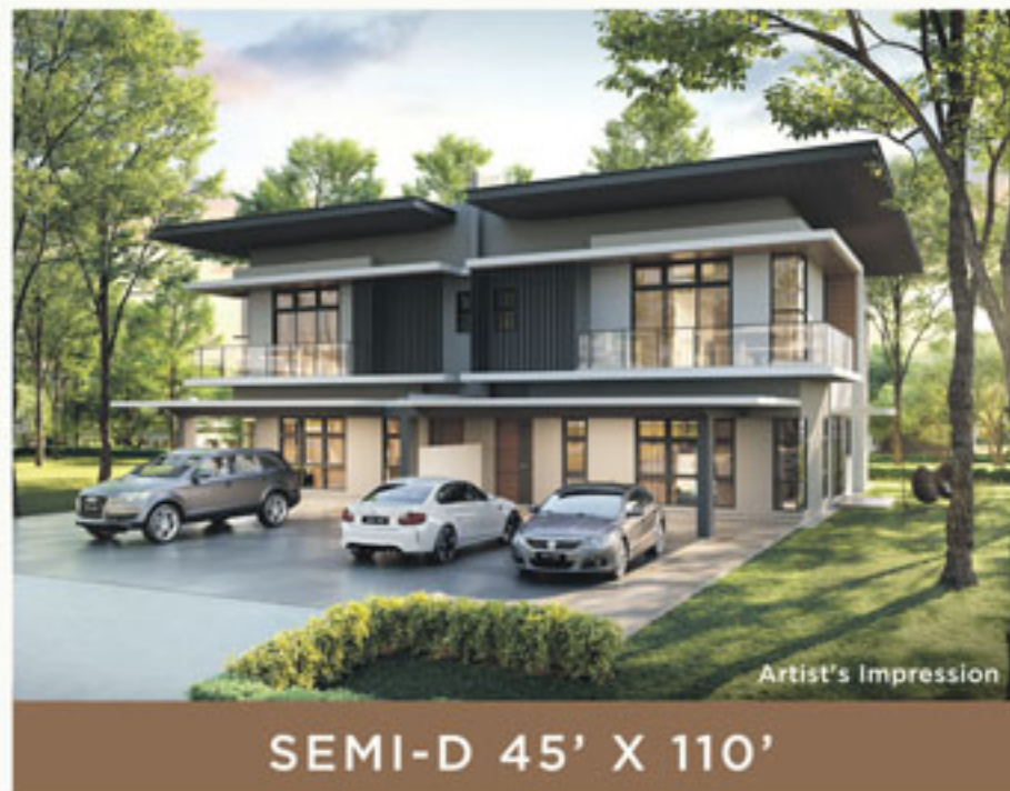
SEMI-D 45' X 110'