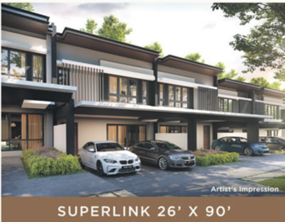
SUPERLINK 26' X 90'