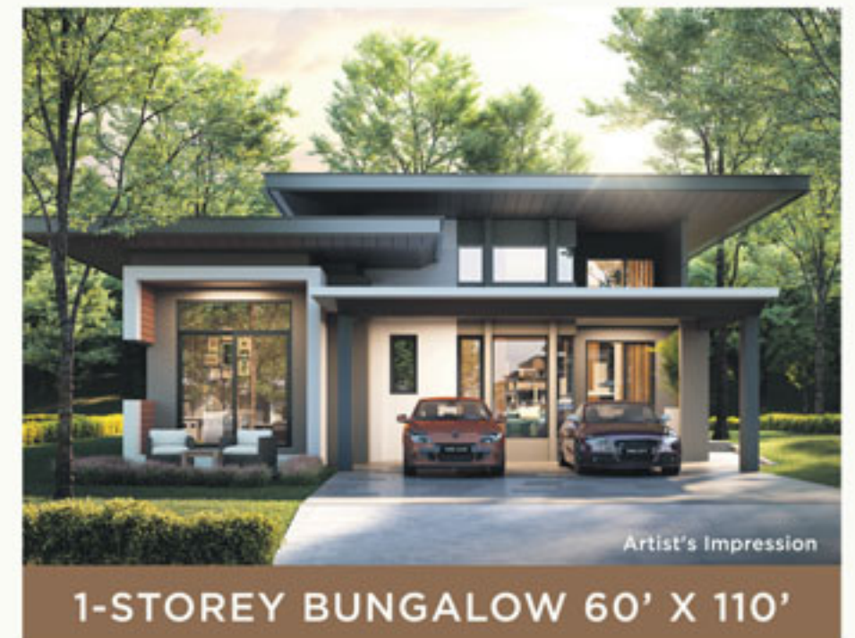
1-STOREY BUNGALOW 60' X 110'