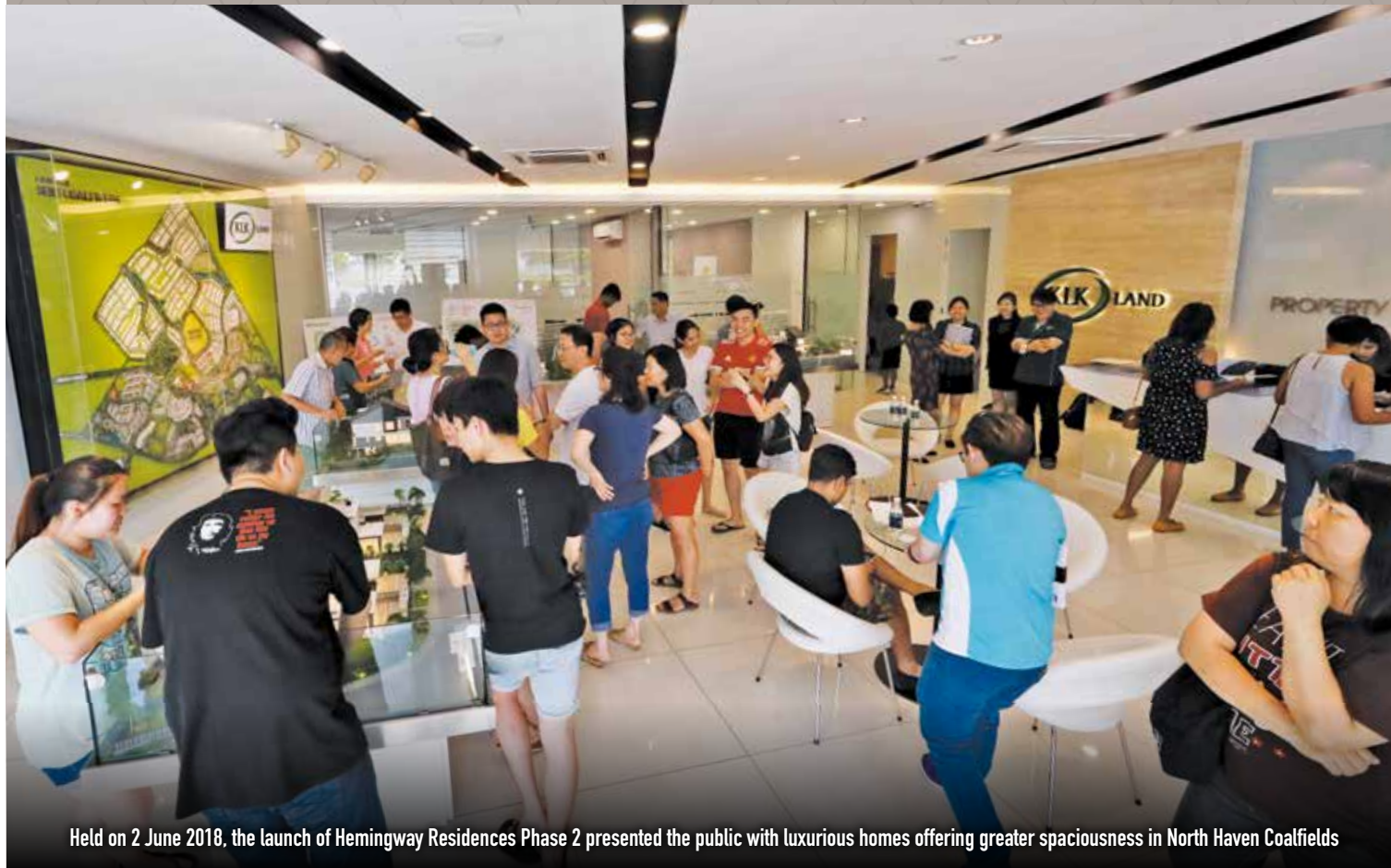
Held on 2 June 2018, the launch of Hemingway Residences Phase 2 presented the public with luxurious homes offering greater spaciousness in North Haven Coalfields