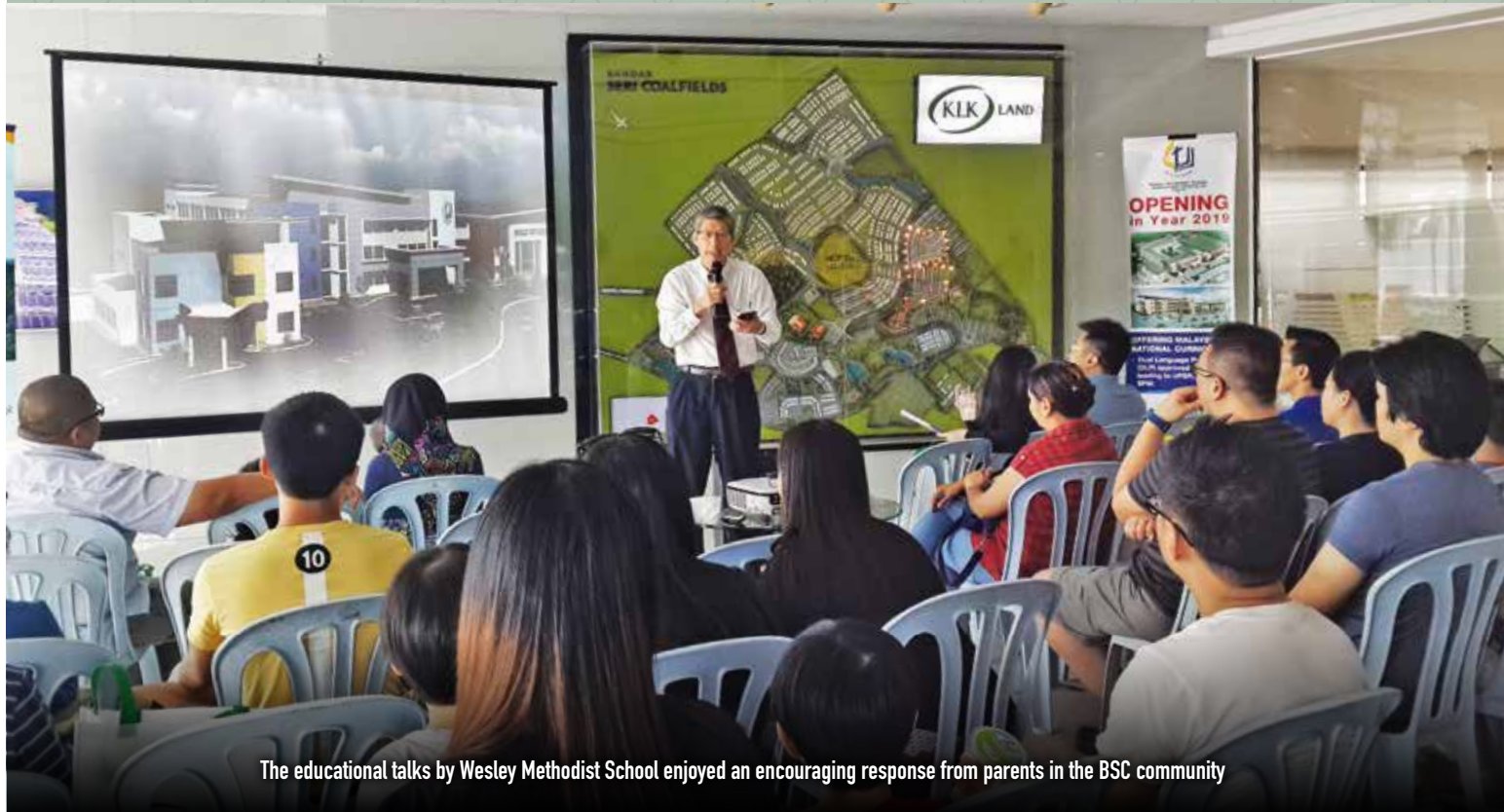
The educational talks by Wesley Methodist School enjoyed an encouraging response from parents in the BSC community