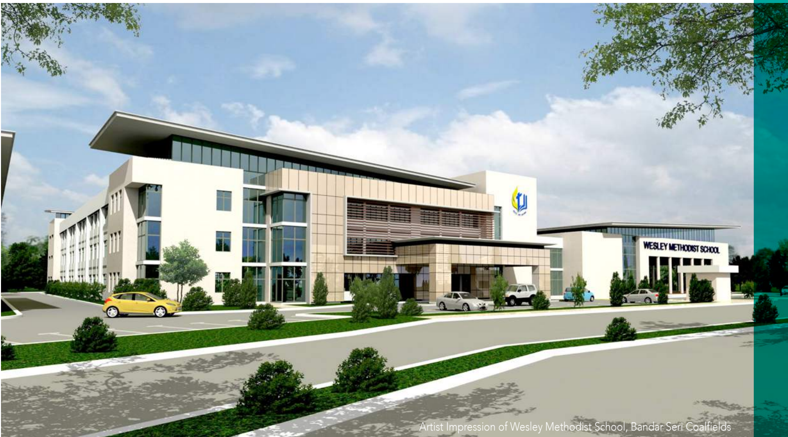
Artist Impression of Wesley Methodist School, Bandar Seri Coalfields

Wesley Methodist School has partnered with KLK to build a private school in Bandar Seri Coalfields Township.